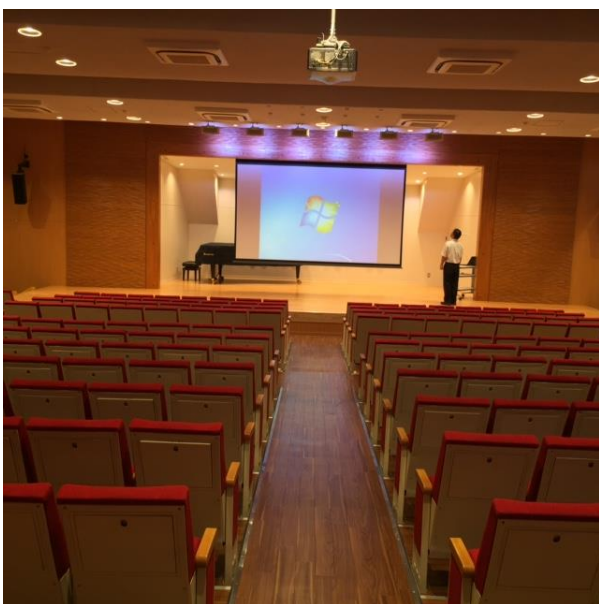
Conference Main Hall; Music Hall 7F

Please ensure compatibility with LCD projectors before your session is started . You can freely use the equipment during coffee break and lunch time.